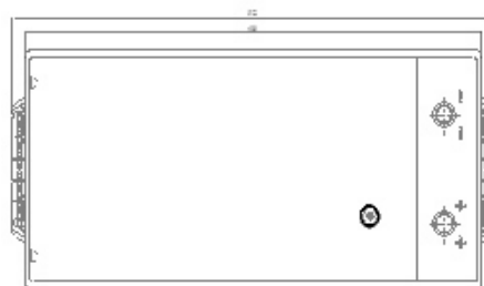
Base hold down